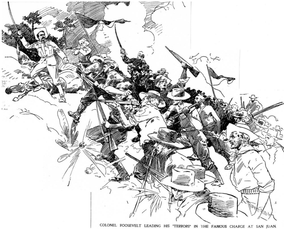
Fig. 2: Charleston News and Courier , July 24, 1898, 13.

essentially erased any southern need for the antebellum-style cavalier figure.